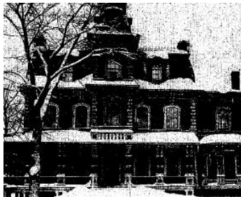
the St. John Infirmary opened in 1914.

During the time that the Sisters were busy opening schools, convents and hospitals out west, back east in Saint John, the demand for a Catholic hospital in their founding city became so great that in 1911 the Sisters purchased a property for the hospital, converted existing buildings into administrative offices and construction began.