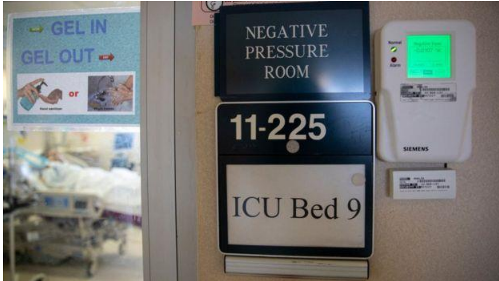
Covid-19 patient lies in the ICU in a hospital in Brooklyn, New York

It's called the Chaplaincy Innovation Lab and was set up in 2018 to explore changes in American religious life, in particular the growing number of people who have no religious affiliation or connection, yet still seek spiritual care.