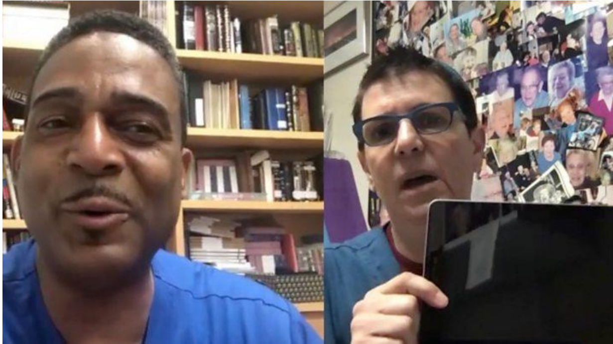
Hospital chaplains on the coronavirus frontline

From FaceTiming worried families to helping doctors and nurses with "combat fatigue", spiritual care workers in hospitals have been thrust onto the pandemic's frontlines.