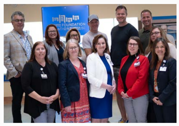
Representatives from Horizon, Outflow Ministry, Canada East Spine Centre and the St. Joseph's Hospital Foundation came together to celebrate this exciting partnership.

The St. Joseph's Hospital Foundation, in Saint John NB, along with Horizon Health Network, Outflow Ministry Inc., and Canada East Spine Centre recently announced the finalization of a partnership which will create convalescent care beds designed to provide a safe and supportive environment for patients experiencing homelessness transitioning from hospital care back into the community. For more information click on this LINK .